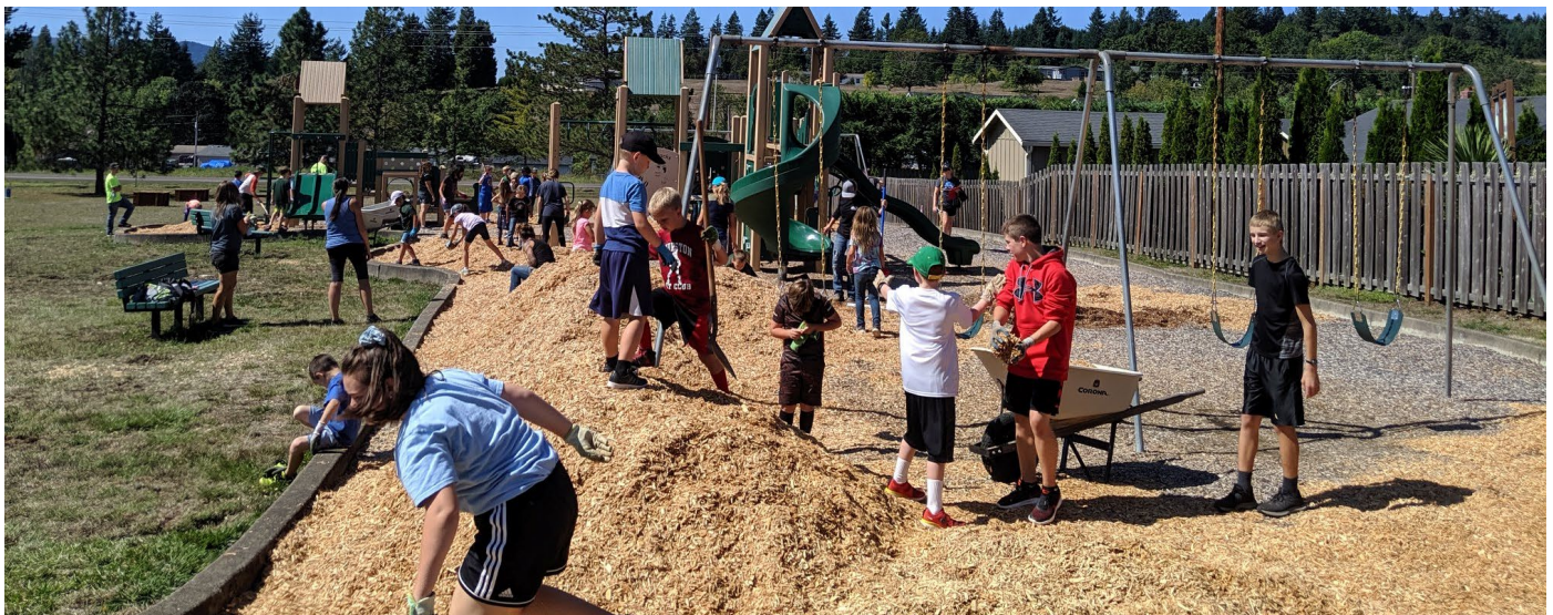
Figure 8: Mountain View Academy "Embrace the Community Day" at Paul Fisher Park.