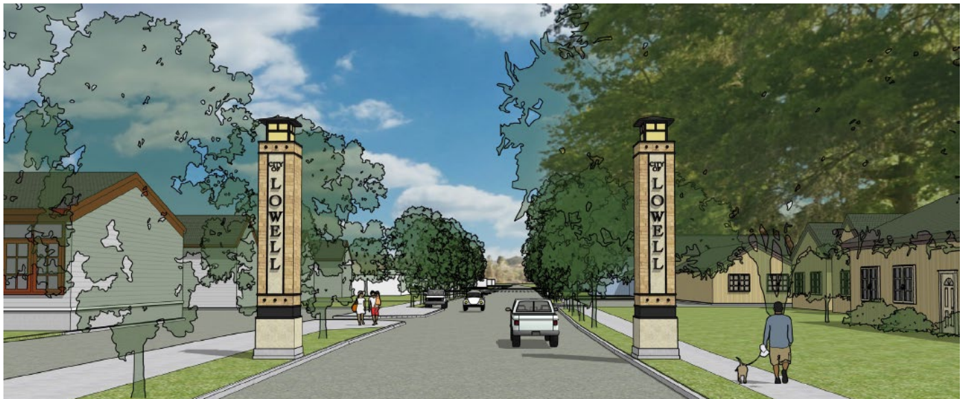
Figure 7: Conceptual rendering of a gateway into downtown Lowell on Pioneer Street.