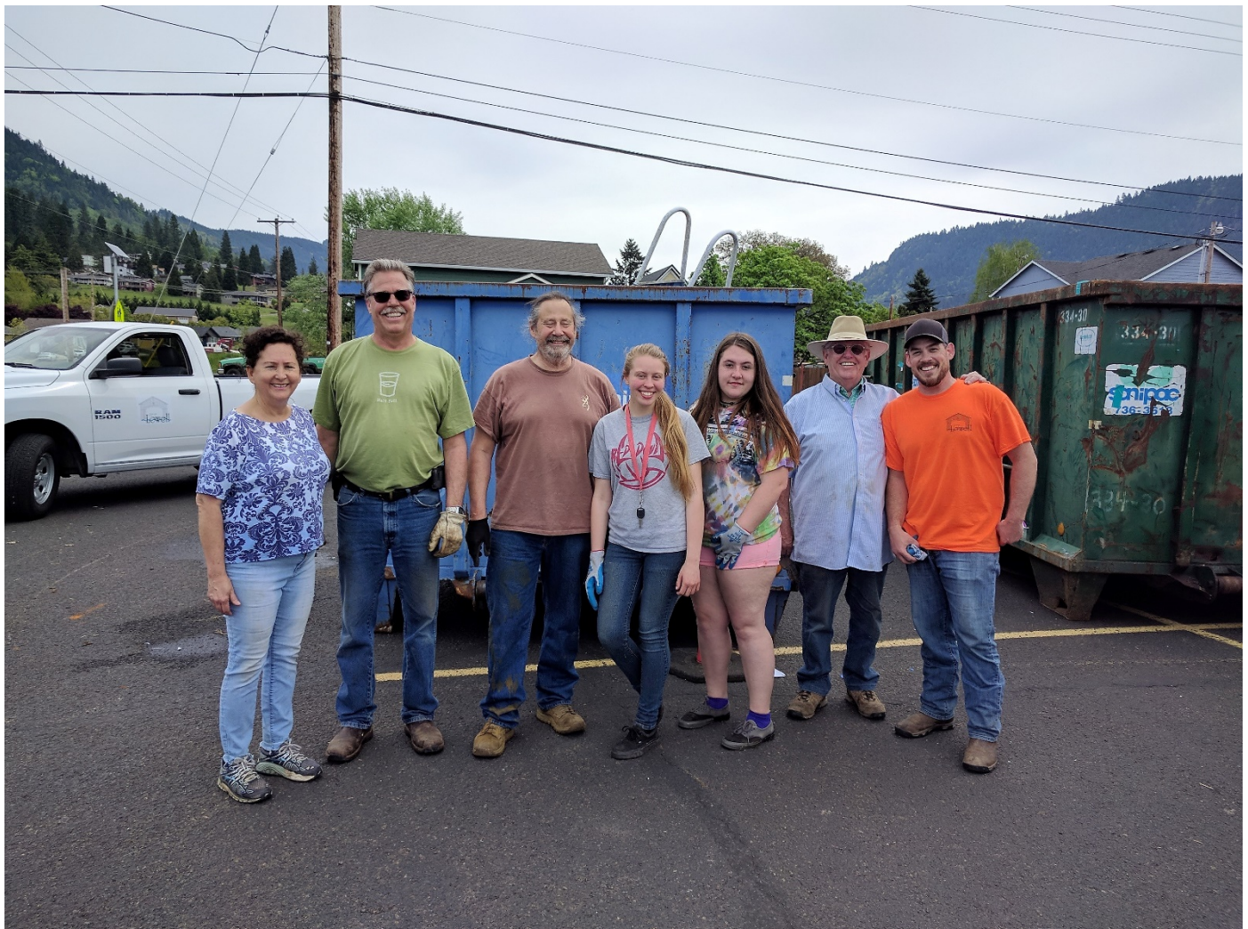
Figure 14: Lowell Beautification Day volunteers.