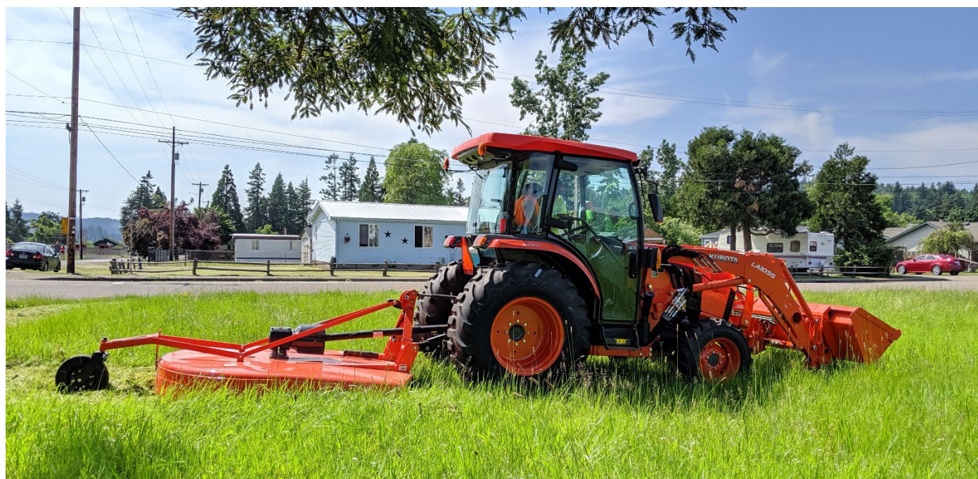
Figure 9: Tractor purchased in 2019 for streets, parks, green waste and sewer plant maintenance.