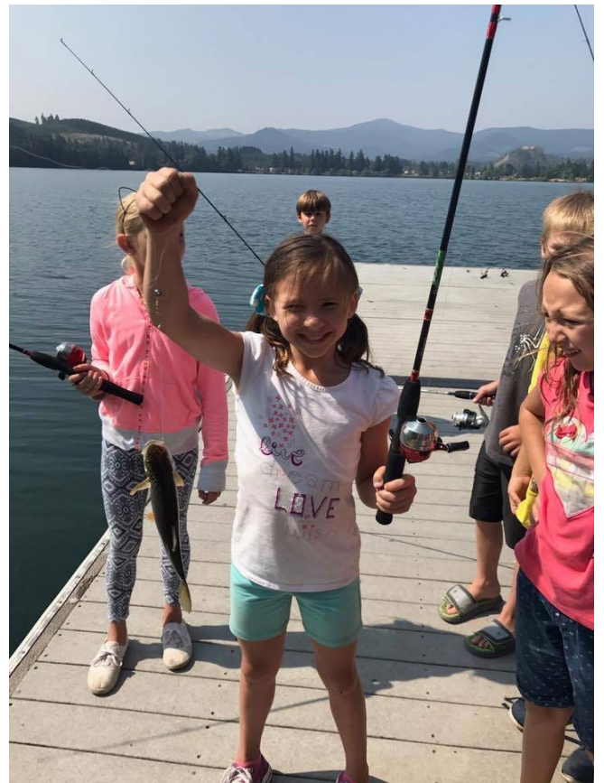
Figure 3: Lowell School District Summer Recreation Program at the Oregon Association of Rowers dock. The program is supported by the Lowell Parks and Recreation Department.

These represent a set of initiatives, actions, or performance measures, which are designed to support the objectives. Work plans are implemented, tracked, and staff submits a quarterly status report to the City Council. Work plan initiatives are revised and prioritized by year to advance the objectives.