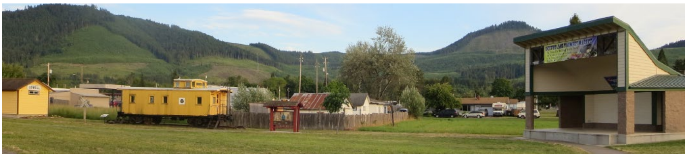
Figure 6: Rolling Rock Park looking south.