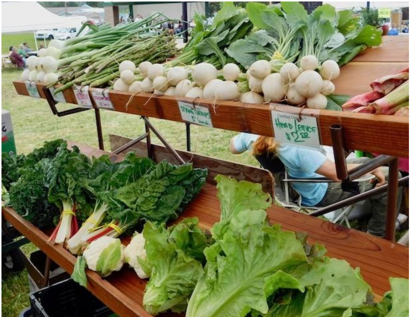
Figure 5: Dexter Lake Farmers Market in Rolling Rock Park.