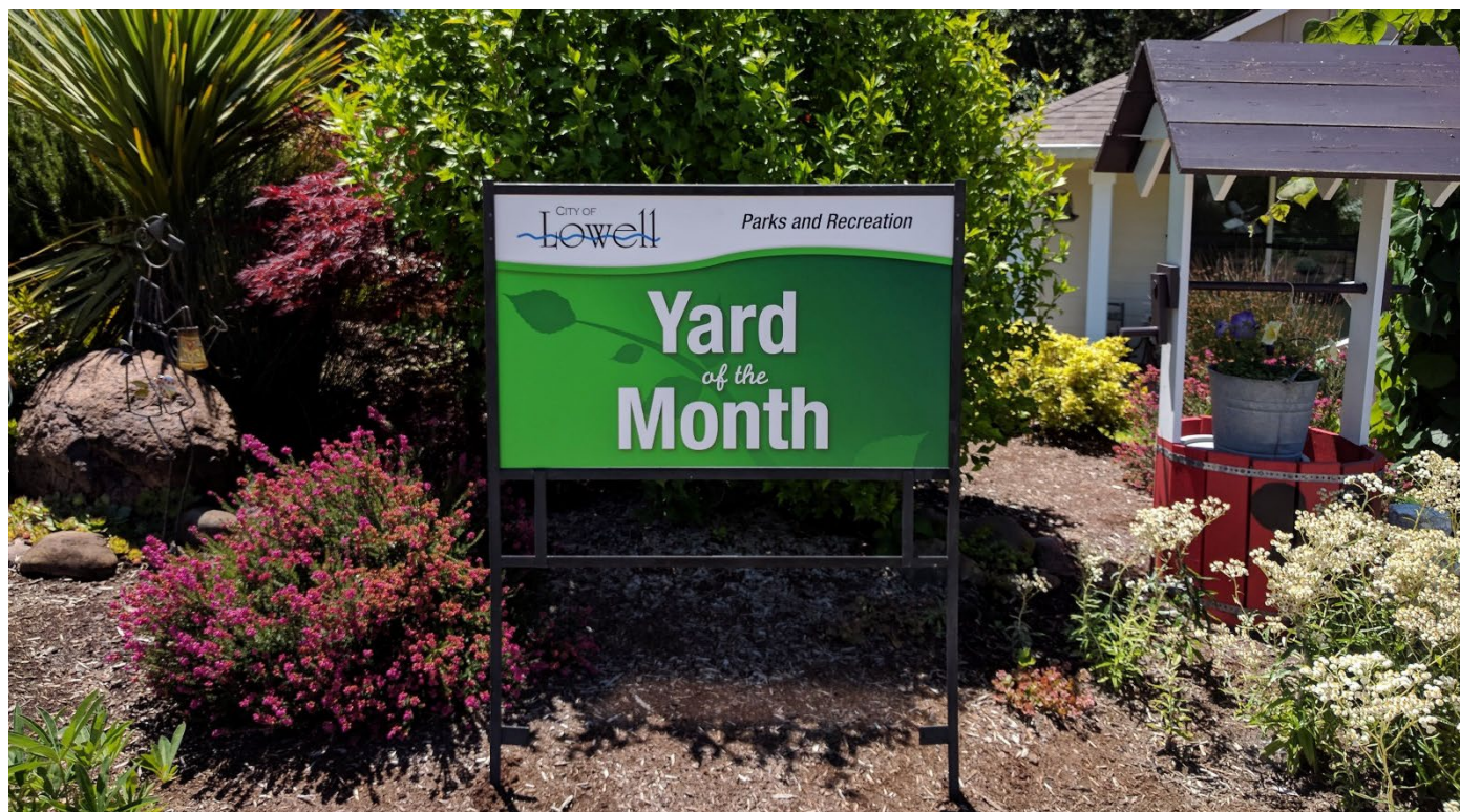
Figure 13: First Yard of the Month Award to Monica Thompson at 92 Wetleau Drive.