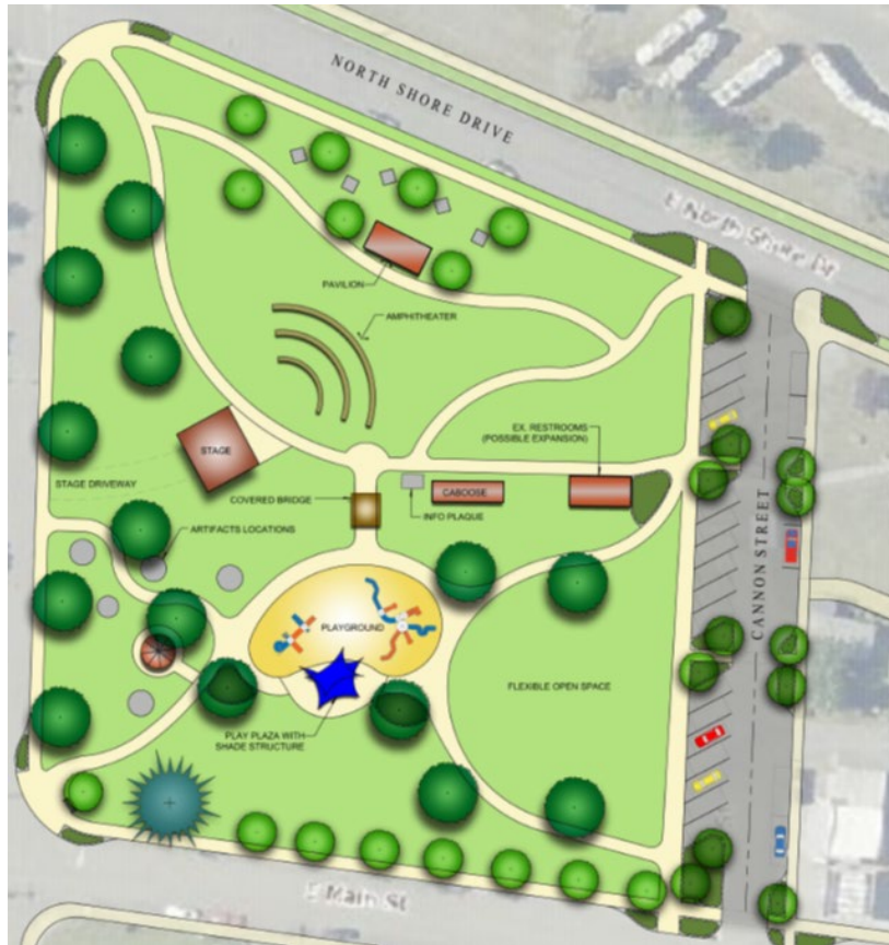
Figure 11: Rolling Rock Park and Cannon Street Festival Area Conceptual Plans