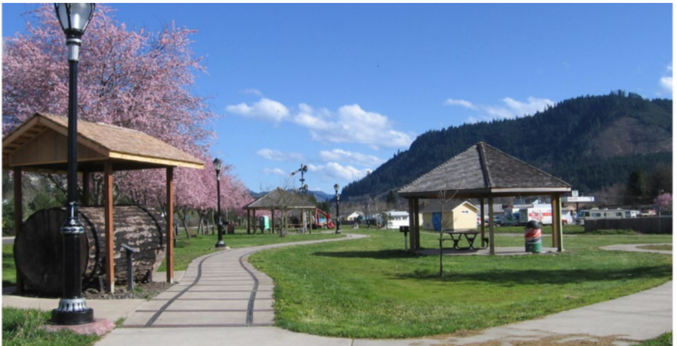
Figure 1: Rolling Rock Park looking east