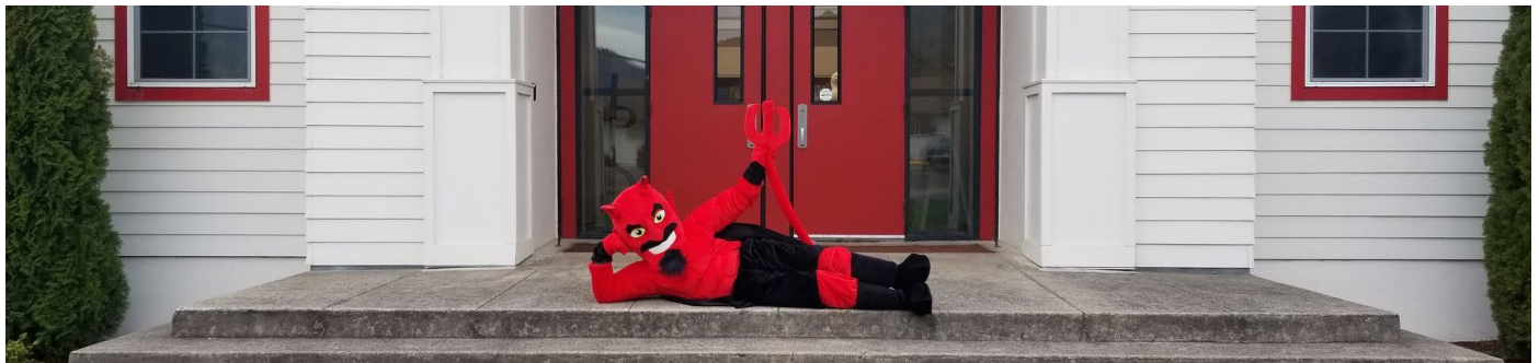
Figure 4: New Lowell Jr/Sr High School “Red Devil” mascot.