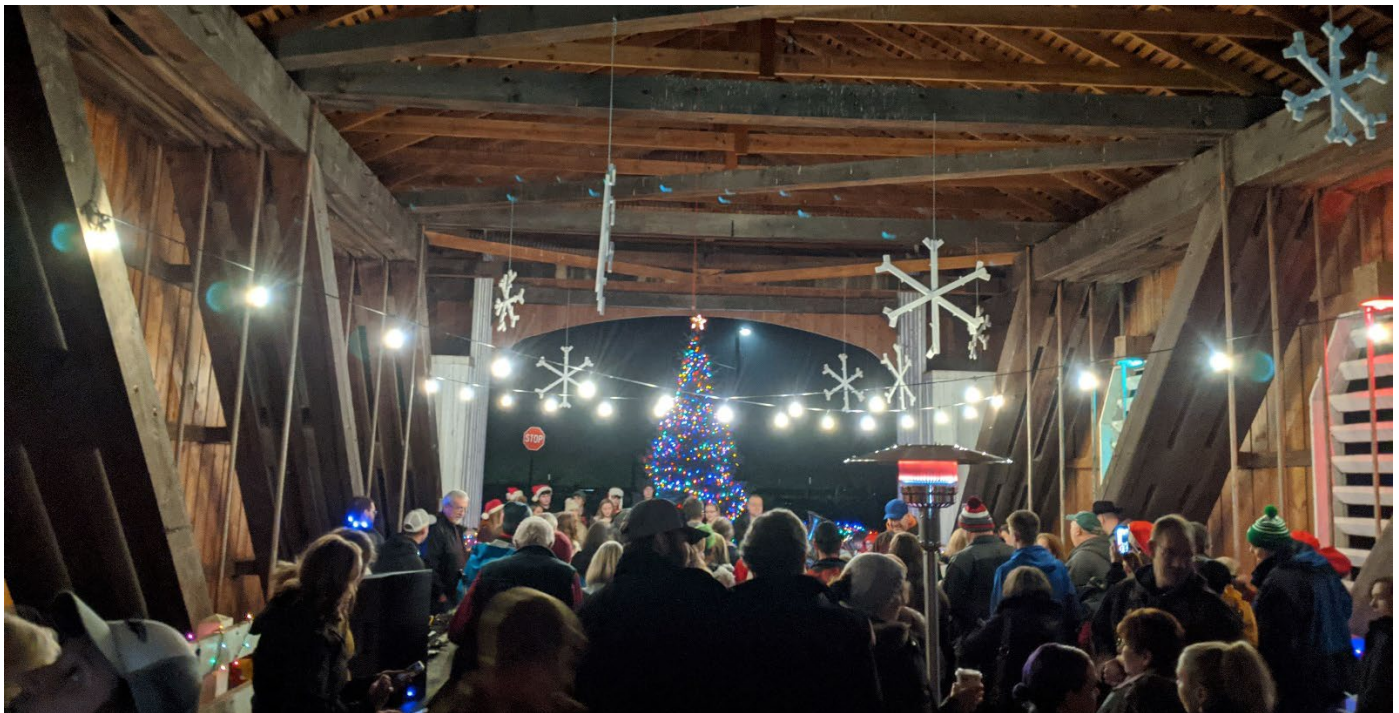
Figure 12: Lowell Covered Bridge Tree Lighting