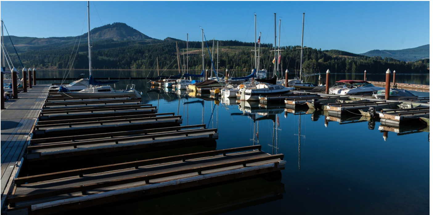
Figure 2: Lowell State Park Marina