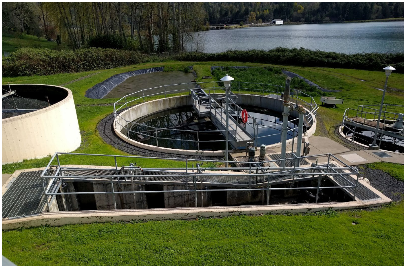
Figure 10: Lowell Sewer Treatment Plant