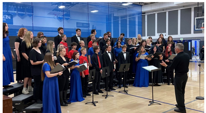
LHS singers featured in the OMEA District 10 Honor Choir

The winter show for Lundy Elementary (and MVA Beginning Band students) will take place two days later on Thursday, December 14th, also at 7:00pm in the HS Cafetorium. Call time for K-5 is 6:45, and 6:30 for Band students. We look forward to seeing you there!